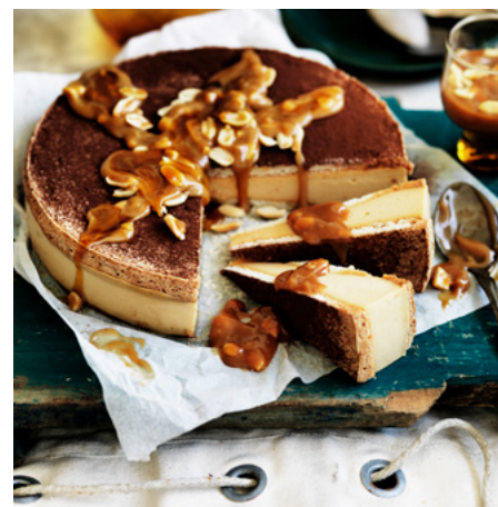
Budget No waste issue