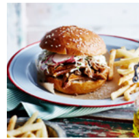
The Baking issue Best ever hacks