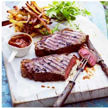
Aussie BBQ No cook/camping/salads