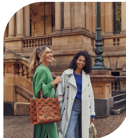
Fashion & Style