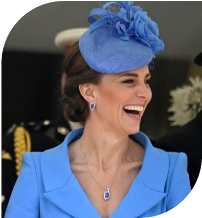
Celebrity & Royals