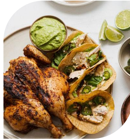
Food & Recipes