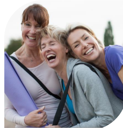
Health & Fitness